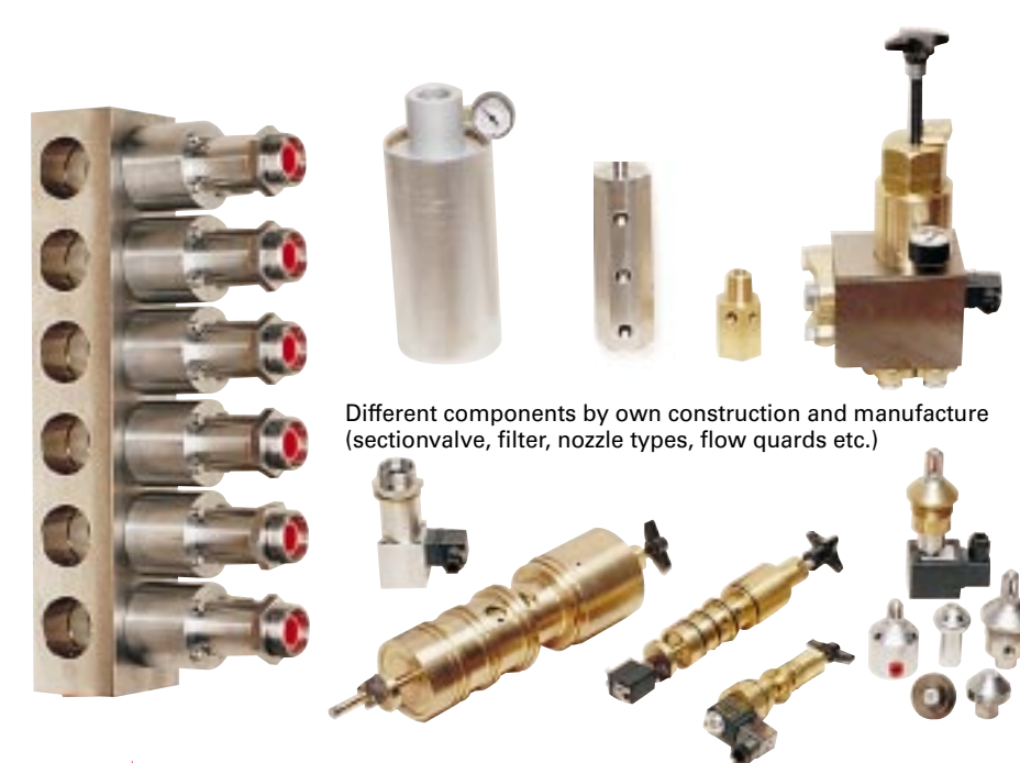
Different components by own construction and manufacture (section valve, filter, nozzle types, flow guards etc.)